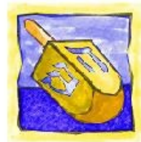
The Dreidel—Rebirth's Logo

We look forward to a prosperous 2008—Come and join us!